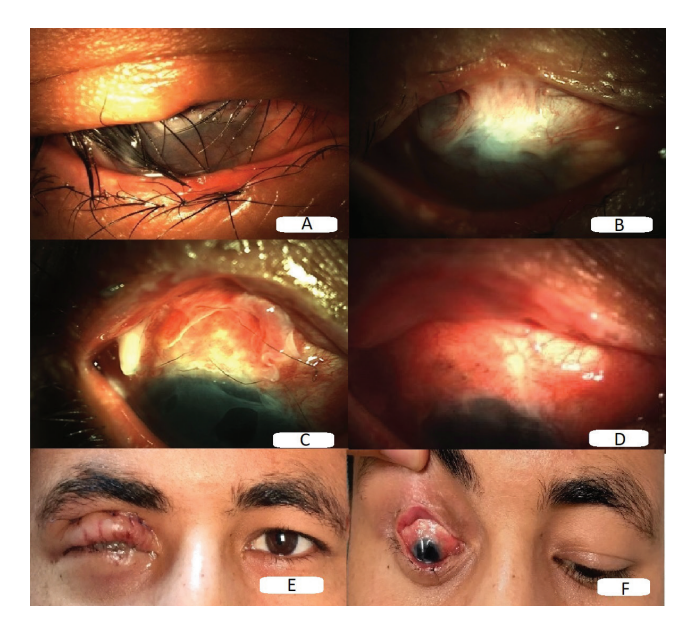
Figure 3. A, B) A 25-year-old man with grade 3a obliteration of the upper fornix after alkali burn and entropion. C) Postoperative 6 months after symblepharon lysis, mitomycin C application, and amniotic membrane transplantation. D) Deep upper fornix on downgaze. E) Postoperative 3 weeks after limbal autograft, amniotic membrane transplantation, oral mucosa graft, and anchoring suture surgery. F) After 25 months, the patient has a deep upper fornix with no entropion or recurrences.