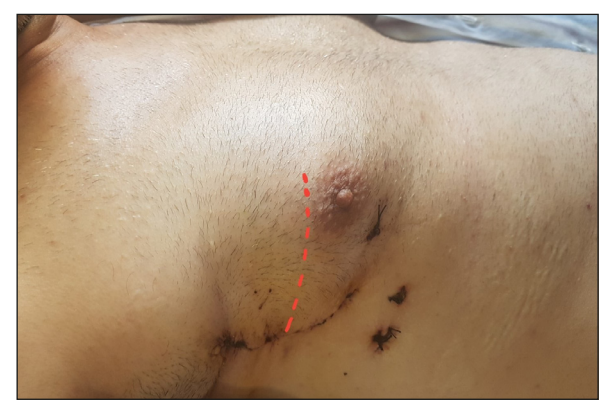
Figure 2. An 8-10 cm right vertical infra-axillary incision made from the second to fifth intercostal space and extending along the anterior or midaxillary line. The entry location to the chest is indicated by the red dotted line.

The ascending aorta was clamped through the incision using a standard cross-clamp. Adequate