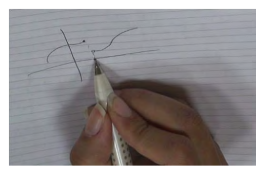
Figure 1. Sandra's example for discontinuity

Similarly, Daniel was confused about limit and continuity. But Sandra wrote an example, drawing a graph from memory, explaining the relationship between continuity and limit. When Daniel said "How does this happen, when it has a limit but is not continuous?", Sandra drew a graph of the function (with jump discontinuity given in Figure 1) to explain.