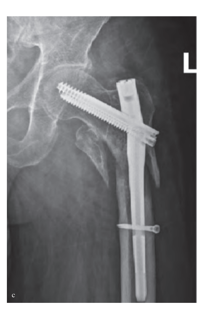
Fig. 3. — (a) AP Radiograph of the left hip showing a AO/ OTA 31-A3.3 fracture (b) post-operative 1. day and (c) At eleven months, a case of mechanical insufficient due to the non-union of an InterTan fixation

When the fracture gap is not well closed and the patient starts weight-bearing, uncontrolled collapse may occur following shortening of the femur and