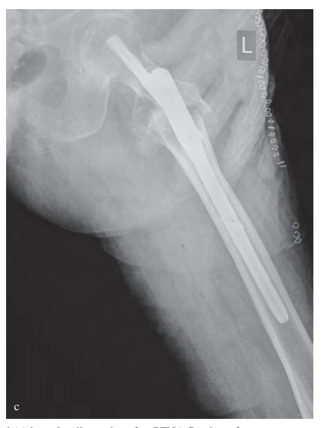
Fig. 1. — (a) AP Radiographs pre-operative (b) post-operative and (c) lateral radiographs, after PFNA fixation of an reverse intertrochanteric fracture (AO/OTA 31-A3.1 type)

In a biomechanical study, it was reported that InterTan nail was biomechanically superior to the PFNA device and mechanical failure was