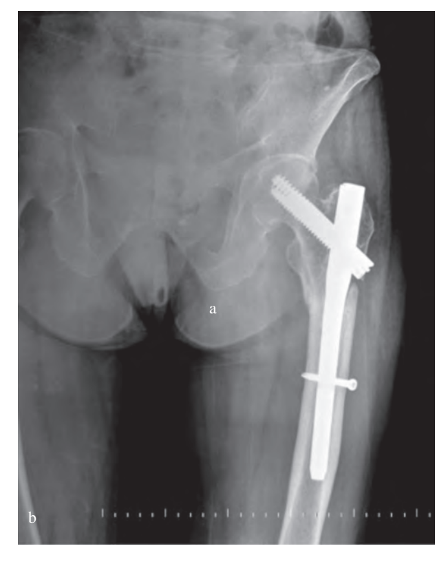
Fig. 2. — (a) AP Radiographs pre-operative and (b) 1 year post-operative, after InterTan fixation of an reverse intertrochanteric fracture (AO/OTA 31-A3.3 type)

observed less (9). In clinical studies of unstable intertrochanteric fractures, while blade cut-out was observed in 6 (6.9%) cases reported by Yu et al. (28), in 2 (4.3%) cases by Zhang et al. (30) and in 8 (9.4%) cases by Zehir et al. (29), no postoperative cut-out was observed in any cases in the InterTan groups. In a series reported by Turgut et al. (25), cutout was observed in 14 (4.7%) patients. Takigami et al. (24) reported cut-out at 4% suggesting that this could have resulted from an inadequate insertion depth of the spiral blade and early full weightbearing. Frei et al. (6) also showed that cut-out of blades may occur with weight-bearing after PFNA device placement. In the PFNA group of the current study, cut-out was seen in 4 (12.1%) cases as the most frequent mechanical failure, and it was not observed at all in the InterTan group. The most important factors to prevent cut-out complications have been reported to be the avoidance of varus reduction and centre-centre or inferior-centre quadrant implantation of the helical blade or lag