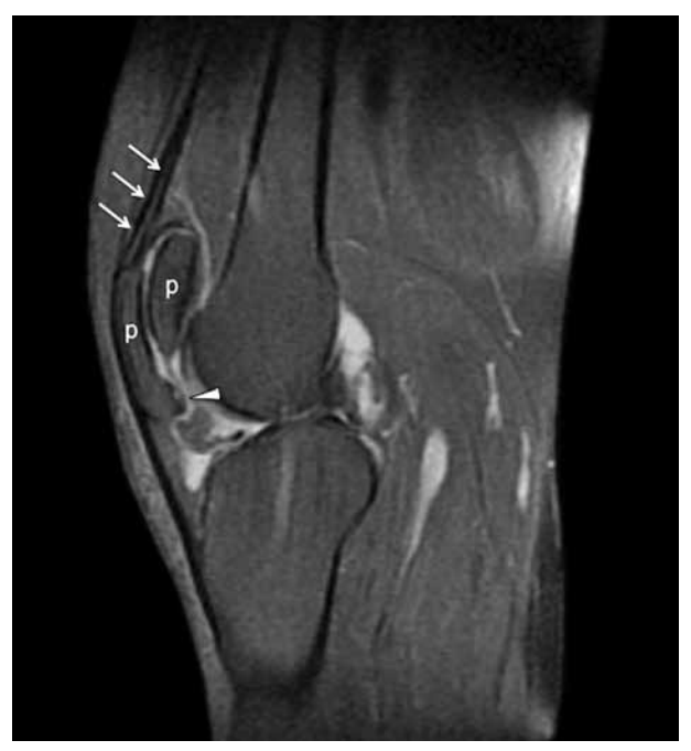
Figure 3. Magnetic resonance imaging (sagittal, T_2 -view) shows joint effusion and degenerative changes (arrowhead). Distal part of double-layered patella (p) is associated with quadriceps tendon (thin arrows), whereas proximal part is not.

between the quadriceps tendon and patella (Figure 3). Laboratory investigations including erythrocyte sedimentation rate and C-reactive protein, calcium, phosphate, and alkaline phosphatase levels were all within normal limits. Overall, the patient was diagnosed with secondary OA due to MED and referred to another center for further genetic analysis. A written informed consent was obtained from the patient.