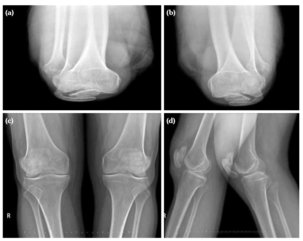
Figure 1. Knee radiographs show a complete double-layered patella in right (a) and left (b) side. Anteroposterior (c) and lateral (d) knee radiographs demonstrate uniform narrowing of joint space, subchondral sclerosis, and degenerative changes in joints.

joints as well. Knee radiographies showed doublelayered patella (DLP), generalized degenerative changes, scoliosis, and circumferential radiopaque