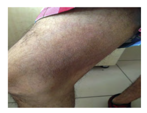
FIGURE 2. Hyperpigmented appearance of the affected area after 3 months of cefixime cessation.

discontinued the drug. Keeping in view the nature of lesions and recurrence of reactions after the use of the same drug, a diagnosis of FDE was made and the patient advised to avoid the use of cefixime. Patch tests were applied to the lesional skin and upper back with cefixime (10% in petrolatum) 6 weeks later; however, the results were negative even though the reaction reactivated after the reuse of the same drug. Patches in the thigh area did not regressed completely after drug cessation and subsided with residual hyperpigmentation (Figure 2).