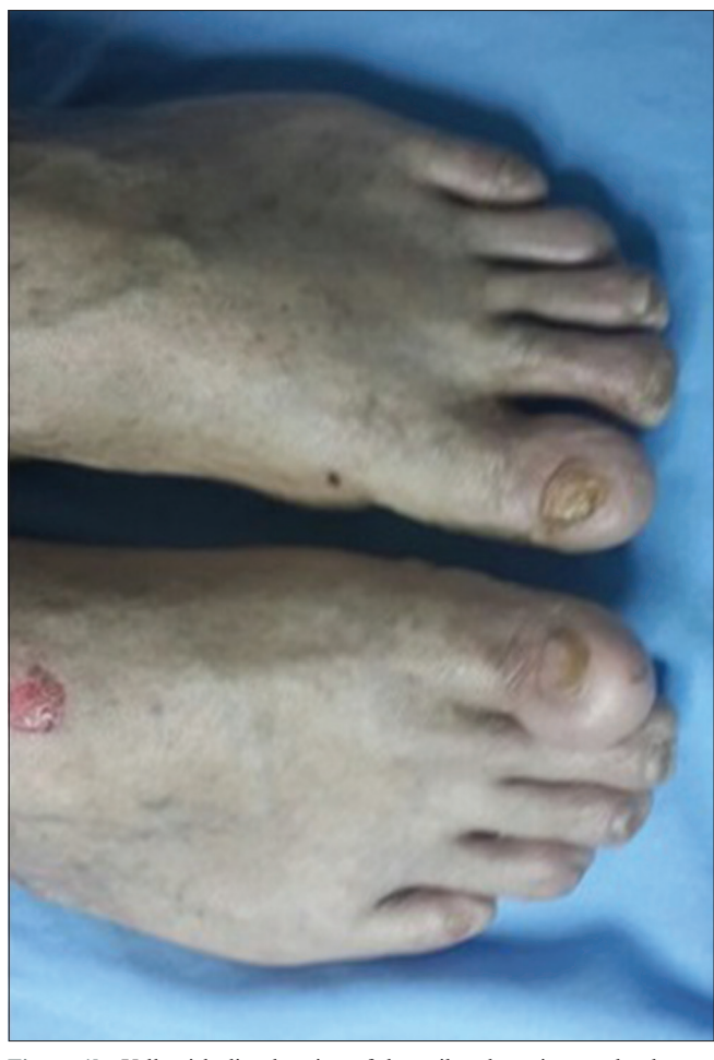
Figure 1b: Yellowish discoloration of the nail and erosion on the dorsum of the right foot