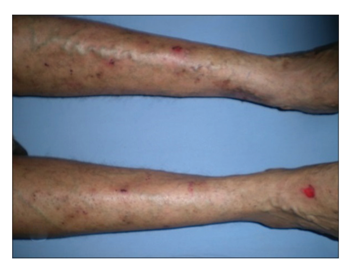
Figure 2b: Erosions on the tibia and the dorsum of the foot

exon 5 of the PKP1 gene, designated as c.897del5 (CAACC).8 We found p.Val472Glyfs*28 (c.1414_1415delTG) mutation in our case, our case's father and the mother, unlike in other reports.