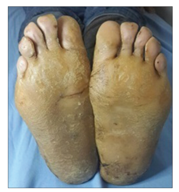
Figure 2a: Plantar hyperkeratosis with fissures