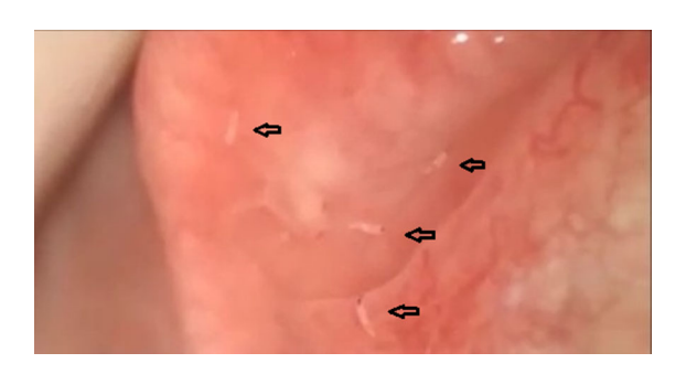
Fig. 1 Oestrus ovis larvae on upper fornix and bulbar conjunctiva

The microscopic examination of the larvae showed that they were oval shaped with segmented bodies and had a pair of large dark oral hooks connected to their cephalopharyngeal skeletons (Fig. 2). According to these findings, they were identified as the first stage of O. ovis larvae.