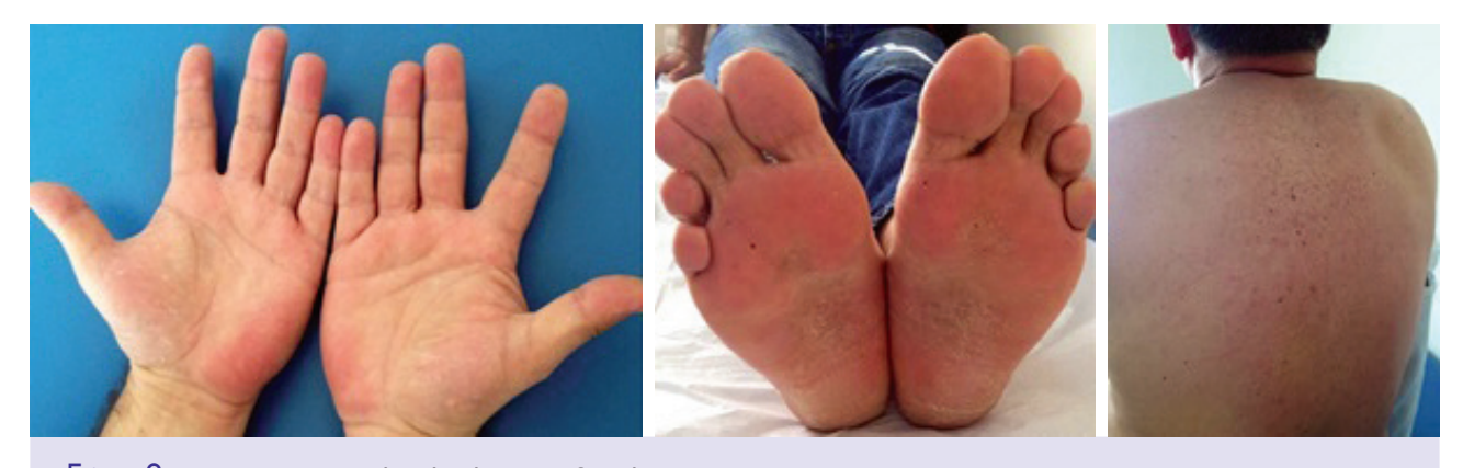
FIGURE 2. Improvement in the skin lesions after the treatment.

Etanercept has systemic adverse effects involving