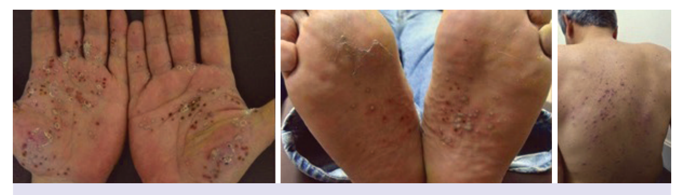
FIGURE 1. Multiple pustular lesions on the palmoplantar areas and back.

dermatological examination, multiple erythematous pustules and papules were observed on the both palmar and plantar regions, trunk, and back (Figures 1-3). There was no bacterial growth on the culture media taken from the pustular lesion.