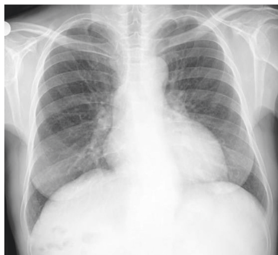
b) 3 months after thepleurodesis.