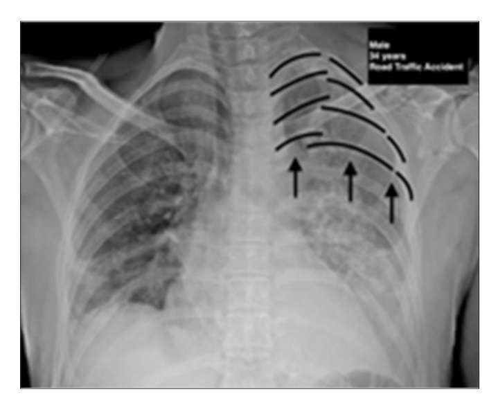
Figure 1: Chest X-ray (PA view) multiple rib fractures (arrows).