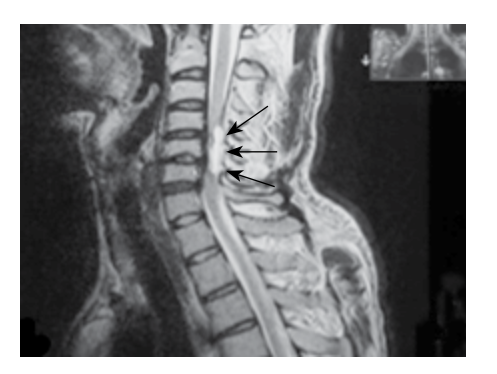
Figure 1. Magnetic resonance imaging, T2 sagittal image. Arrows outline the hematoma spanning between C4-C6 levels

problems. A further detailed history revealed that he had frequent oral aphthous ulcers and posterior uveitis sequela in the left eye. History of genital ulcers, erythema nodosum or other skin lesions was absent. Physical examination revealed hypoesthesia below C6 bilaterally. Manual muscle testing showed weakness in C8 and below myotomes bilaterally, with a score of 4/5. Deep tendon reflexes of upper and lower extremities were hyperactive. Plantar reflexes and Hoffmann's signs were positive bilaterally. Ambulation on level surfaces was safe and independent, however physical assistance was required on non-level surfaces. Anal sphincter tonus was normal and bulbocavernosus reflex was present. Neurological examination indicated a C8 level incomplete tetraplegia.