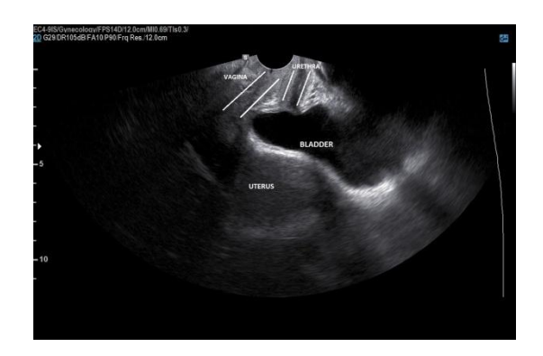
Figure 1. Anatomy of the urethra

The endovaginal ultrasound scan was performed with the transvaginal probe of Medison SonoAce X8 Ultrasound Machine. The patient was lied down in a semi-lithotomy position. The transducer was placed in the vagina and pushed forward by 2-3 cm for the increased visibility of the bladder and urethra.