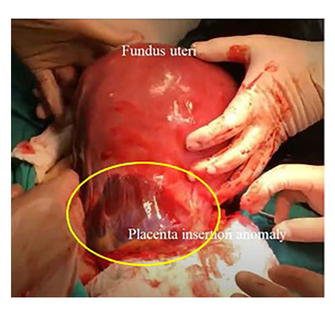
Fig. 2. Appearance after removal of the gravid uterus out of the abdomen at the high transverse incision.

the transversalis fascia by the use of gentle finger dissection. Beginning laterally, the transversalis fascia and peritoneum were divided transversely by using curved Mayo scissors. After reaching the abdomen, the gravid uterus could be pulled out of the abdomen in all cases including the ones in which the placenta reached the umbilicus. The infant was delivered by performing a vertical hysterotomy in the uterine fundus in cases undergoing hysterectomy (Figs. 2,3). A midline transverse hysterotomy was performed in patients undergoing organ-preserving surgery (segmental resection).