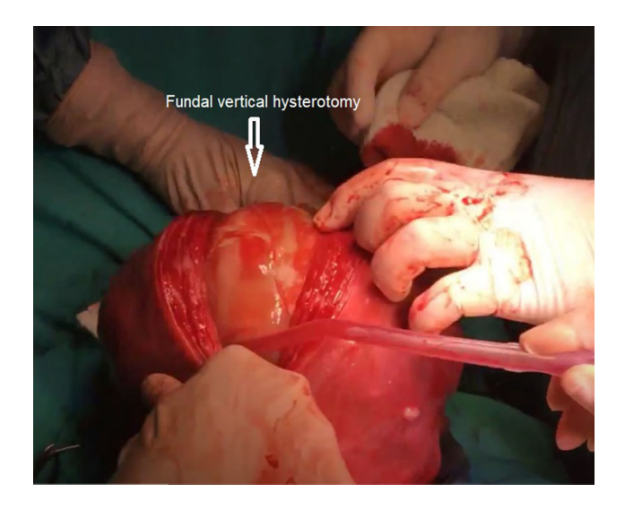
Fig. 3. In the patients with a high transverse skin incision, the gravid uterus could be pulled out of the abdomen, and a fundal vertical hysterotomy was performed for delivery of the infant.