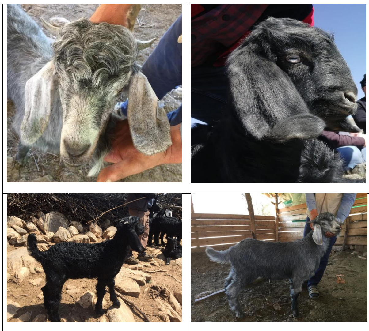
Figure 1. Study material, Manavlı kids.

Live weights of kids were obtained fortnightly pickily and precisely. Hence, no interpolation method was applied on the data. While the births of 40 percent of kids were completed in the same day, 30 percent of them were in the following 3 days after birth, and the remaining ones' were in the following 7 days after birth. Thus, all births were completed within a week. In the current study, zoometrical body measurements (such as rump height, rump width, body length, height at withers, heart girth, head, ear and tail lengths, front and back wrist girth) were defined at 30-day intervals from birth up to 5 months of age. The survival rates of the kids were determined with reference