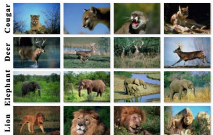
Fig. 1. Sample of dataset images.

Therefore, in this paper, we are focused on reducing the number of features while maintaining similar accuracy to the original 2048 featured data. The image data consists of complex shapes in variant positions. The vector-based representation of them cannot be efficiently utilized with linear based dimensionality reduction algorithms like PCA [14]. To overcome this problem, manifold learning based non-linear dimensionality reduction algorithms used to reduce the number of features before classification algorithms are applied.