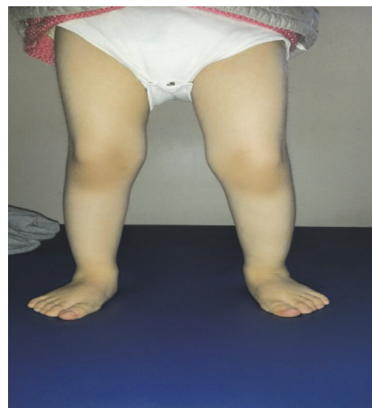
FIGURE 2: Her standing position (wide gait).

Therefore, the magnitude of the progress achieved following our physiotherapy and rehabilitation practices is not clear. The third limitation is that no formal speech assessment or IQ assessment was performed during the study.