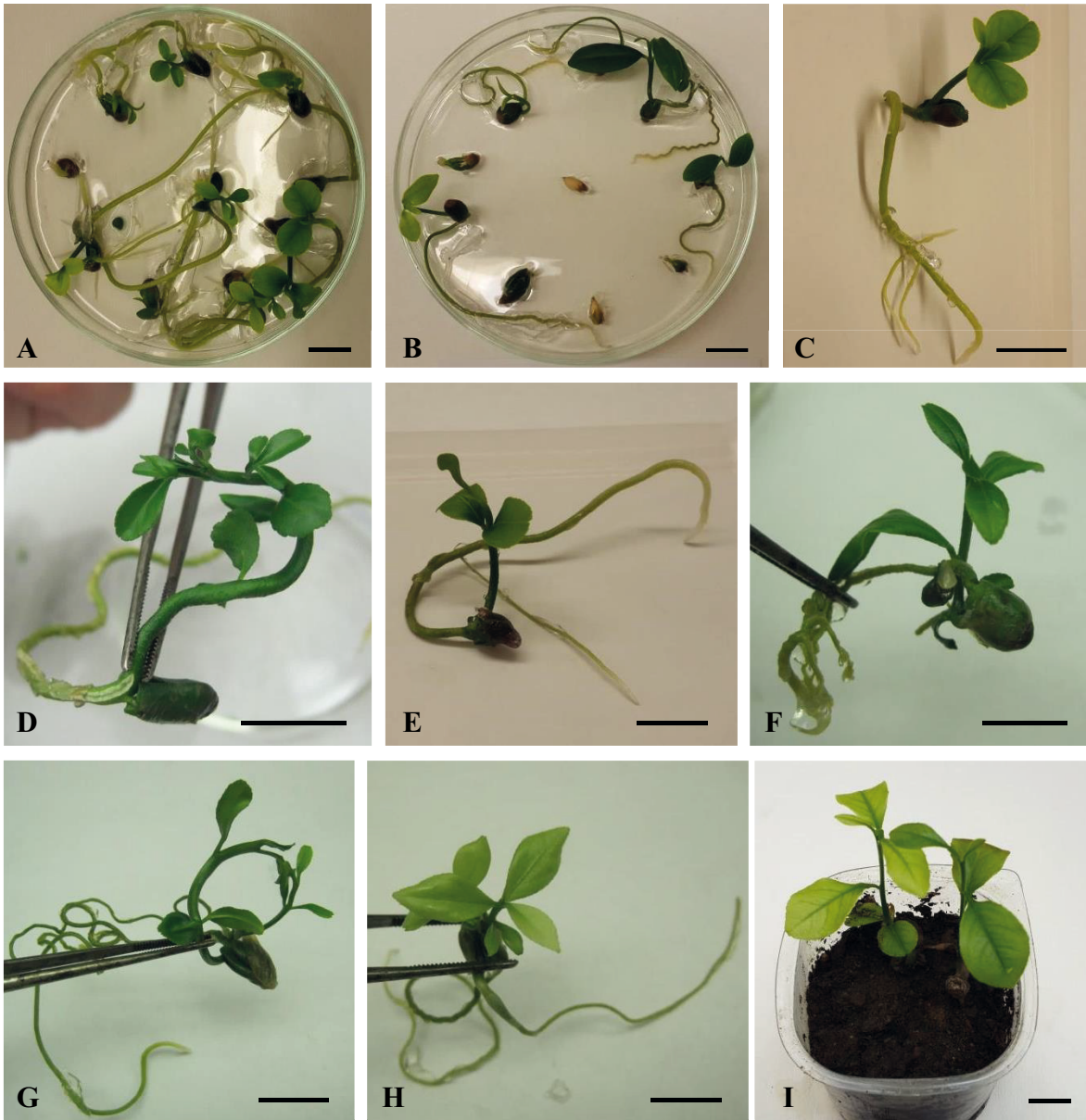
Figure 2. Germinated and acclimatized seedlings derived from cryopreserved citrus seeds: A) seedlings of Citrus jambhiri Lush. germinated after 12 h of dehydration and B) Fortunella margarita (Lour.) Swingle germinated after 3 h of dehydration, followed by direct immersion in liquid nitrogen, thawing, and plating on germination medium. C–H) Plantlets derived from seeds 4 or 6 weeks after cryopreservation: C- Citrus limonia Osbeck, D- Poncirus trifoliata Raf. × C. sinensis Osb., E- C. jambhiri Lush., F- C. limon (L.) Burm.f., G- C. aurantium L., H- Fortunella margarita (Lour.) Swingle. I) Acclimatized plantlets of Citrus limonia Osbeck in greenhouse conditions (bars: 1 cm).

Maximum tolerance to the cryopreservation procedure, in terms of viability and germination, was observed for seeds of C. jambhiri Lush., in which 93.3% of seeds germinated after 12 h of dehydration to 21.1% MC, followed by direct immersion in liquid nitrogen, thawing, and plating on germination medium (Figure 2A). Conversely, the