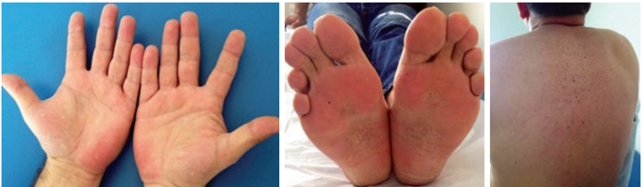
FIGURE 2. Improvement in the skin lesions after the treatment.

Etanercept has systemic adverse effects involving