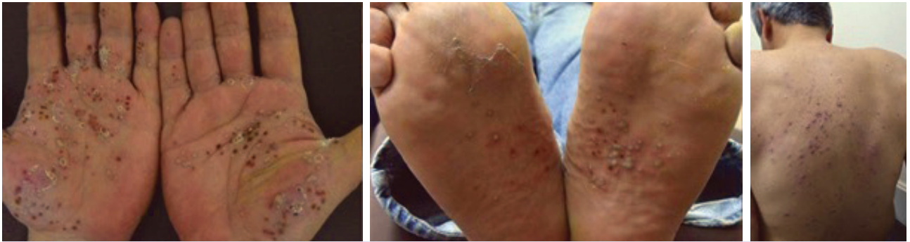
FIGURE 1. Multiple pustular lesions on the palmoplantar areas and back.

dermatological examination, multiple erythematous pustules and papules were observed on the both palmar and plantar regions, trunk, and back (Figures 1–3). There was no bacterial growth on the culture media taken from the pustular lesion.