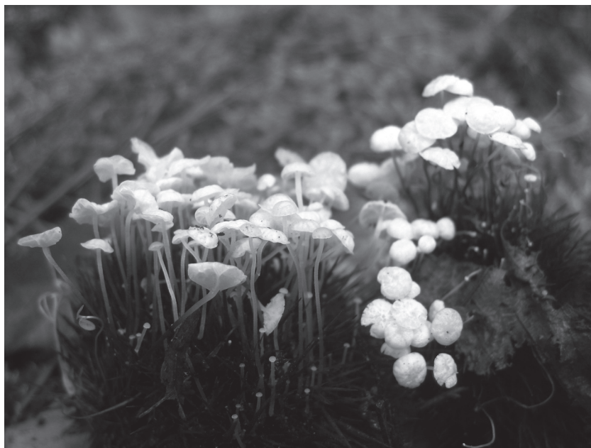
FIG. 1. Marasmius castaneophilus (from holotype; photo by H.Alli)

4). 2. type: 15\text{--}35 \times 15\text{--}20 \mu\text{m} , broom cells of the rotalis-type, broadly clavate to pyriform with projections. PILEIPELLIS hymeniform, a mixture of three types of elements. 1) 15\text{--}18 \times 8\text{--}10 \mu\text{m} , clavate, thin-walled, rotalis-type cells with long projections 2) smooth clavate cells and 3) 20\text{--}27 \times 4\text{--}5 \mu\text{m} , fusiform or lageniform, thin-walled and smooth (FIG. 5); the former the most common. CLAMP-CONNECTIONS present.