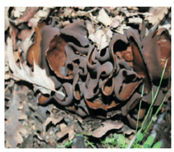
Figure 1. Otidea bufonia; a) ascocarps

Denizli, Buldan-Sarıgöl road, Kelledere district, in pine forest, under Cistus laurifolius , 4.11.2006, Türkoğlu 3067, 3088.