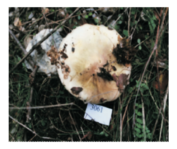
Figure 3. Russula nauseosa a) basidiocarps

Although according to the recent literature (Solak et al., 2007) the number of Turkish macrofungi is about 2400, new records have been observed from time to time. In this study, 3 new records of macrofungi are reported from Buldan district (Denizli). Otidea bufonia is very similar to pezizas; however, it differs in its spores being elliptic-fusiform and containing 2 oil drops. Hebeloma cavipes is recognised easily by its radish smell and rough spores at the generic level, and characteristics of Hebeloma cavipes are the bottle-shaped cheilocystidia at the specific level. Russula nauseosa grows under pine and is known by its mild taste and wine or pink colour.