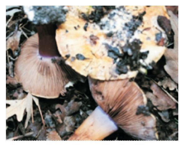
Figure 2. Hebeloma cavipes; a) basidiocarps