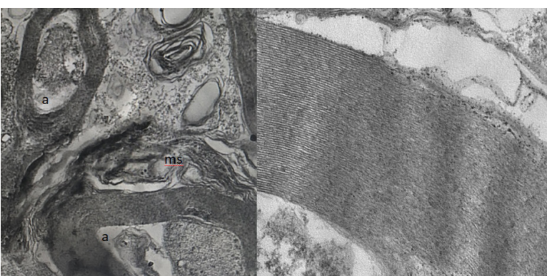
Fig. 3 - Electron microscopy examination of the spinal cord. The image on the left side shows a view of a subject from the I/R group. a: axonal/myelin separation and axoplasmic dissolution. ms: myelin separation. The image on the right side shows regular myelin sequences in the electron microscope view of a subject in the group that received propolis.

peroxide. In our study, the mean MPO levels were higher in the I/R group at the 24 th and 48 th hours after the procedure compared to the Pr group and there was a significant difference between the two groups ( P=0.037 and 0.023 , respectively).