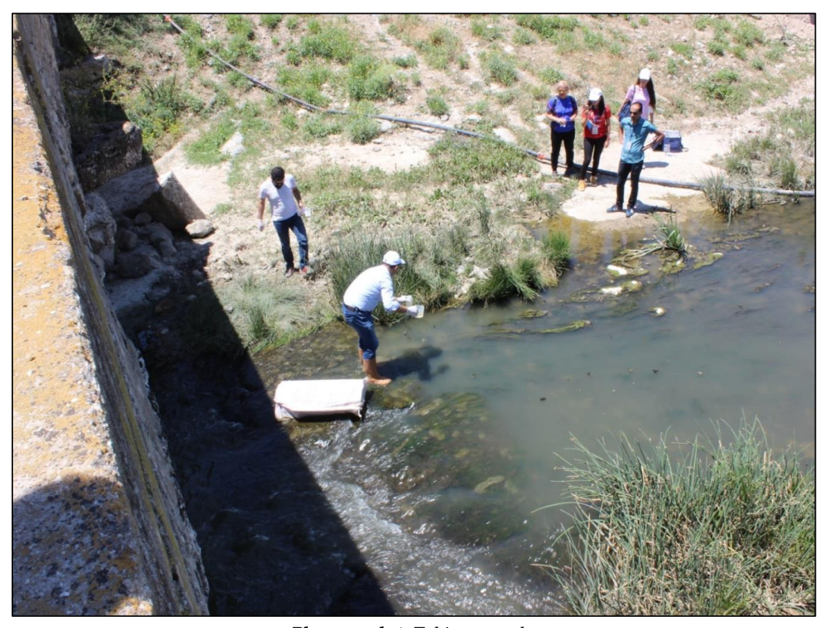
Photograph 1. Taking sample

The physical-chemical properties of the stream water and the dominant species in the algae community differed between the starting and ending points of Akarçay. Physical-chemical characteristics of Lake Eber, dominant species in the algae community have shown that the lake is polluted and has eutrophication. The pollution level increases as it approaches the urban area and reaches the highest level in Lake Eber. The sources of pollution detected both in Akarçay and Eber Lake where it spills are related to thermal facilities, industrial wastes and agricultural activities. Although the urban liquid wastes of Afyonkarahisar are treated, there are also illegal discharges that do not enter the treatment system. This pollution is an extremely serious threat to natural life in the Akarçay basin. At the same time, the use of contaminated water in the basin in agricultural activities seriously endangers human health. In order to solve these problems, waste water of thermal facilities and industrial facilities should be collected before mixing with Akarçay and subjected to advanced treatment processes and urban wastes should be completely controlled.