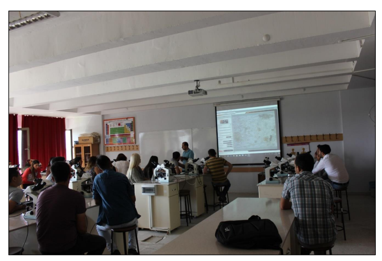
Photograph 2. Examination and enumeration of epiphytic algae and phytoplankton under light microscope