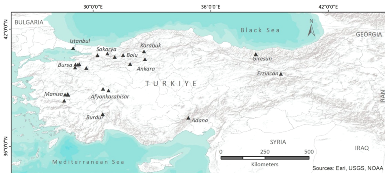
Figure 1. Locations of bottled mineral waters.