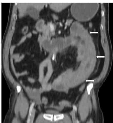
Figure 2: Coronal reformatted CT image showed the diffuse wall thickening of the jejunal segment due to hemorrhage.

The INR was 11,3 and the hemoglobin level was 11,5 g/dl. It was noticed that the patient was using Warfarin in 5mg dosages for the past month; however the patient did not know when the last time was and in what dosage he took the medication. Volume replacement was administered with crystalloid fluid infusion and intravenous Vitamin K was performed to the patient. While monitoring in our emergency department the patient was becoming more symptomatic. Blood pressure was 80/40 mmHg and control hemoglobin was 9,5 g/dl. Prothrombin complex concentrate (PCC) (Factor II/VII/IX) 250ie 10 ml 10 vials was administered in the emergency department. Control INR resulted as 1.2 about one hour later and control hemoglobin was not decreased. The patient with normal hemodynamic parameters was hospitalized in general surgery service for follow-up and treatment purposes. The patient's abdomen was relieved in his first day of hospitalization and was able to defecate. He was discharged with the suggestion of polyclinic check-up.