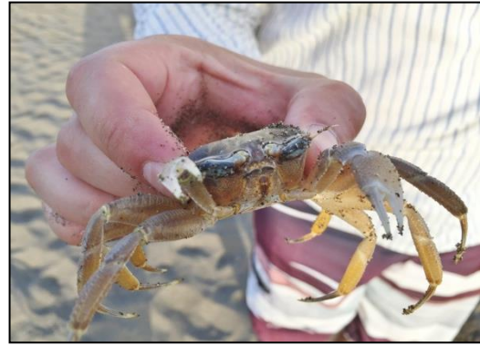
Figure 1: Ocypode cursor .

Excel'07 and Statistica'7 to reveal the statistical background. From the statistical results, standard deviation values and correlation matrices were used to test the hypothesis of study.