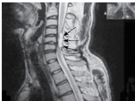
Figure 1. Magnetic resonance imaging, T2 sagittal image. Arrows outline the hematoma spanning between C4-C6 levels