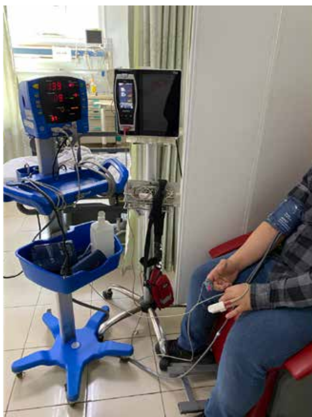
Figure 1. An example of vital signs and PI assessment at the triage. Blue arrow Carescape V100 Vital Signs Monitor's pulse oximetry. Red arrow Masimo SET pulse oximetry.

SBP: Systolic blood pressure, DBP: Diastolic blood pressure, MAP: Mean arterial pressure, HR: Heart rate, RR: Respiratory rate, SpO2: Oxygen saturation, PI: Perfusion index.